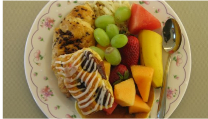
▲ Cutting down on waste at events by bringing your own plates. Doesn't it just look and feel more nice and homey this way, too?

and utensils to coffee hour, brunch, and all other events serving free food.