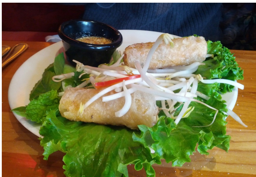
The Rouleaux. "It was piping hot, crispy, and stuffed with deliciousness."

We both got the Nyuom Trasad with Soba Noodles as our second course, mine with chicken, his vegan. While I found the food itself to be delicious, it was way too hot for me. This is not the restaurant's fault - it is advertised as having a "spicy chili-lime tuk trey" dressing, but be aware that this is indeed pretty spicy. I can handle a little bit of spice (I'm a red curry on the scale of massaman to green curry), but this was just a little too much for me. My companion said that his was just fine and delicious, though, so he probably has a better handle on spiciness than me =) The cool temperature felt good though on a summer night.