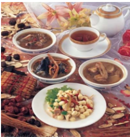
Traditional Chinese Food

The architectural style here is very different from what we have in China. Last September when I walked the Freedom Trail, I was attracted by the old churches, sculptures and the city hall. I also learned a great deal about the Colonial Revolutionary Boston and the Independence War.