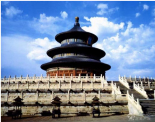
The Temple of Heaven in Beijing

Everything here is different from what I was used to in China. From the very beginning of orientation, my schedule was full of wonderful activities. While in China we went out for barbecue and karaoke, I feel that people here are wild about parties, dancing, bars and beer. Students are more social and outgoing. They keep talking and laughing in the office, which is unheard of in Chinese universities. Students from East Asia are used to keeping quiet in classrooms and offices.