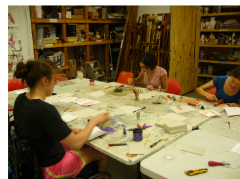
Ashdowners absorbed in their printmaking