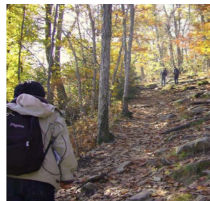
Fall Foliage Trip

When my plane landed in the US after 19 hours of flight, I was curious about everything in this new continent. Looking down through my window, I was shocked by the endless sea of lights in Chicago. At 2 am I finally got to my new home in Ashdown. I felt lonely at first, because for the first time I was tens of thousands of miles away from my hometown in China and knew nothing about life in the US. The staff at the front desk warmly received me and showed me around Ashdown. He told me that I was lucky to live in the best dorm at MIT. After living here for over seven months, I believe what he said was absolutely true.