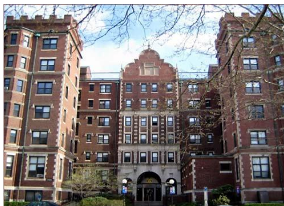
New Ashdown (left) and Maseeh Hall (right), the renovated face of Old Ashdown, both enjoy vastly different reputations from Old Ashdown in several important aspects