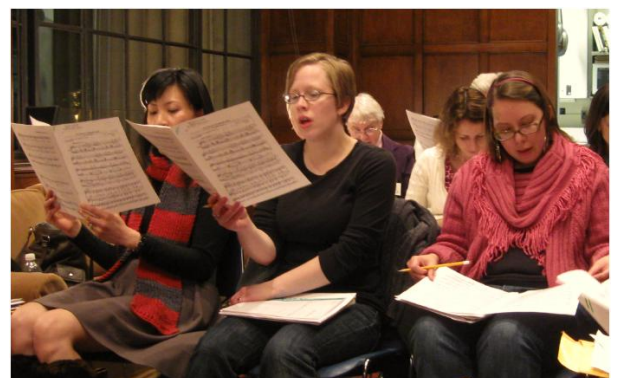
The Chorale in action

A note for music lovers: The MIT Women's Chorale will be performing Johann Michael Haydn: St. Leopold Mass on Sunday, May 15, 2011 at 3 pm, at the Dante Alighieri Society. Free and open to the public. Details at http://web.mit.edu/womensleague/womenschorale/