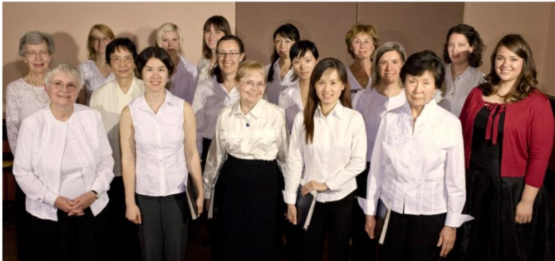
Some faces of the MIT Women's Chorale

I have sung in choirs on and off since I entered grade school, and even had the opportunity to do a tour of concerts in schools and churches throughout England with my Canadian high school choir. Singing with a group is fun, active, and also an effective stress reliever. I thought that joining a recreational singing group at MIT would be a perfect opportunity to maintain my hobby while meeting new people.